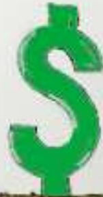
Cost of $10,000 for Various Payment Gaps